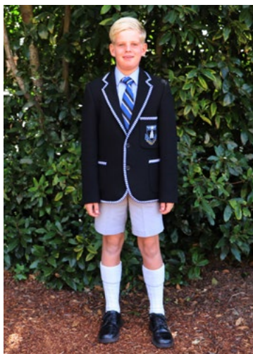
Boys Summer Uniform