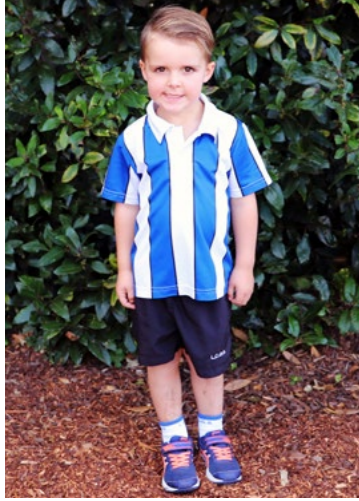
Boys Summer Uniform