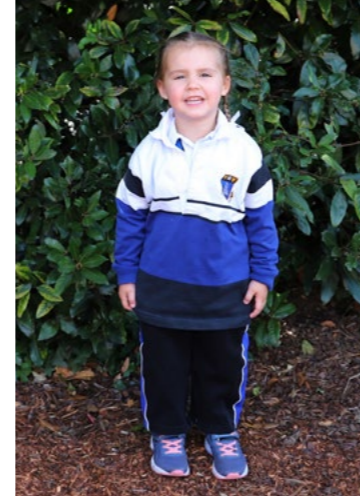
Girls Winter Uniform