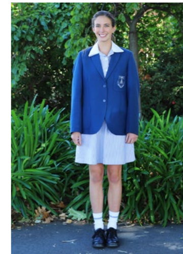
Girls Summer Uniform