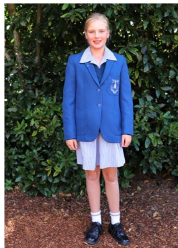
Girls Summer Uniform