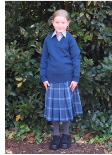
Girls Winter Uniform