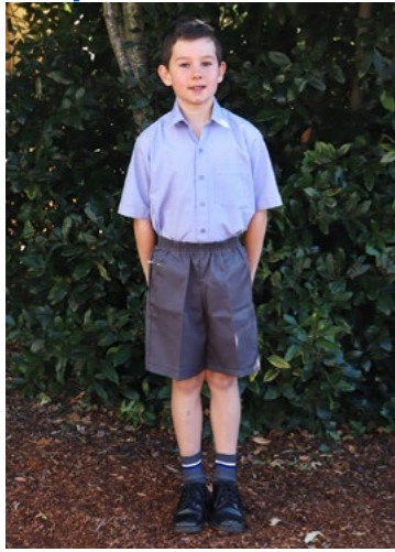
Boys Summer Uniform