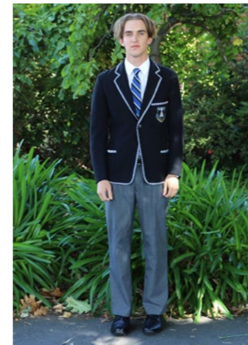
Boys Winter Uniform