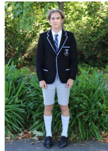
Boys Summer Uniform