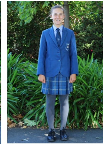
Girls Winter Uniform