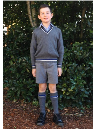
Boys Winter Uniform (Note: optional trousers)