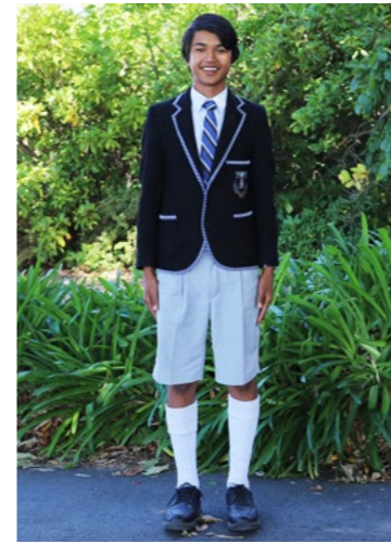
Boys Summer Uniform