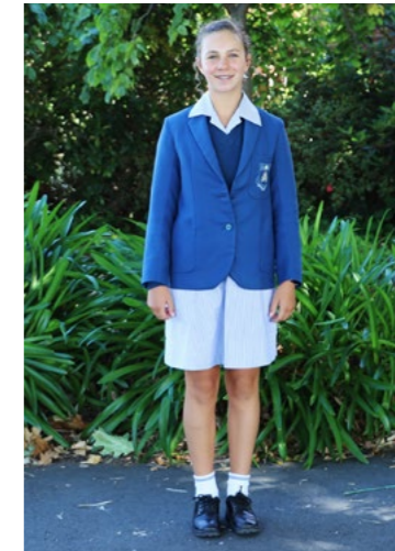
Girls Summer Uniform