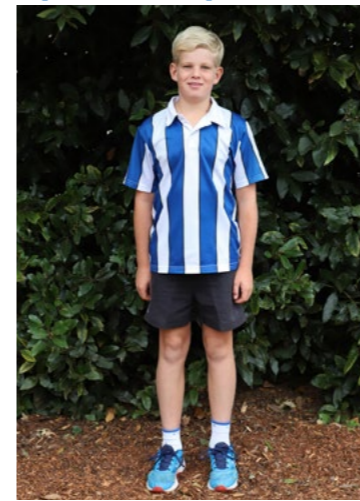
Summer (Note: rugby top and track pants to be worn to and from school)