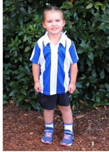
Girls Summer Uniform