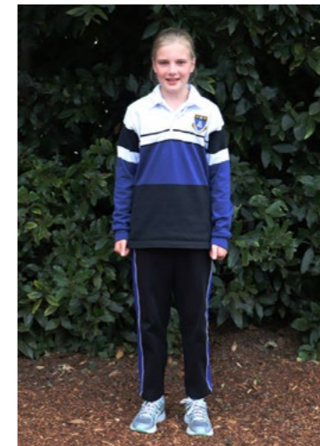
Winter (Note: rugby top and track pants to be worn to and from school)