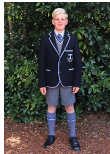
Boys Winter Uniform (Note: optional trousers)