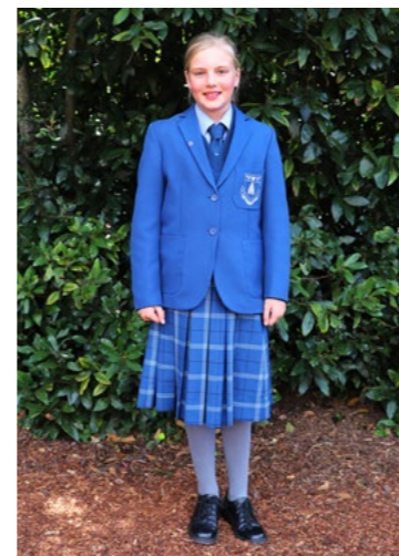
Girls Winter Uniform