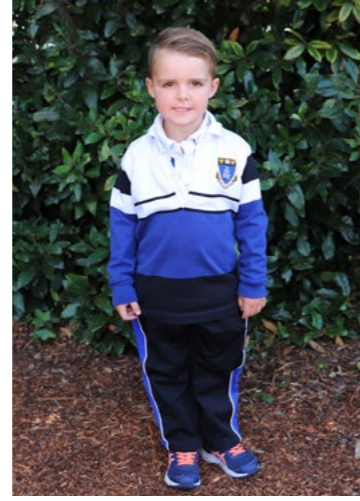
Boys Winter Uniform