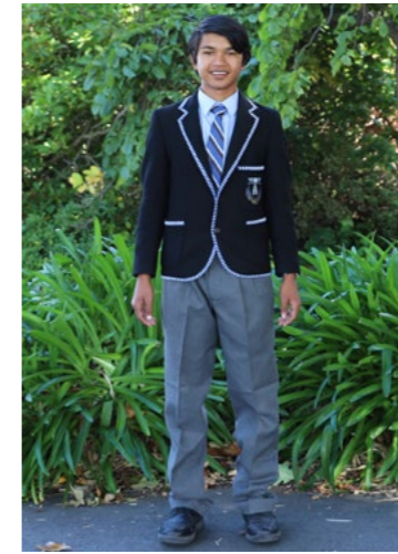
Boys Winter Uniform