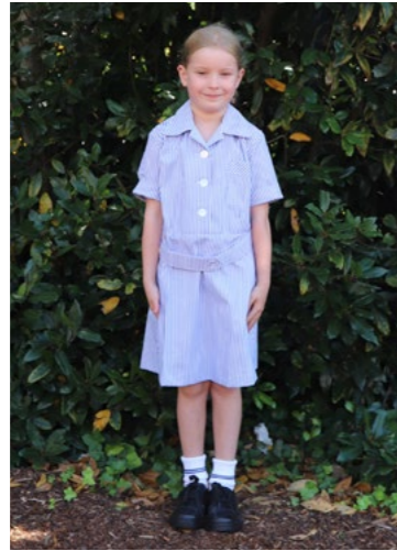
Girls Summer Uniform